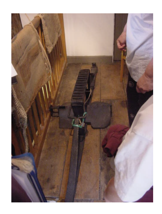
This is the man trap

There was lots of stuffed animals and a man trap that cuts your leg off.